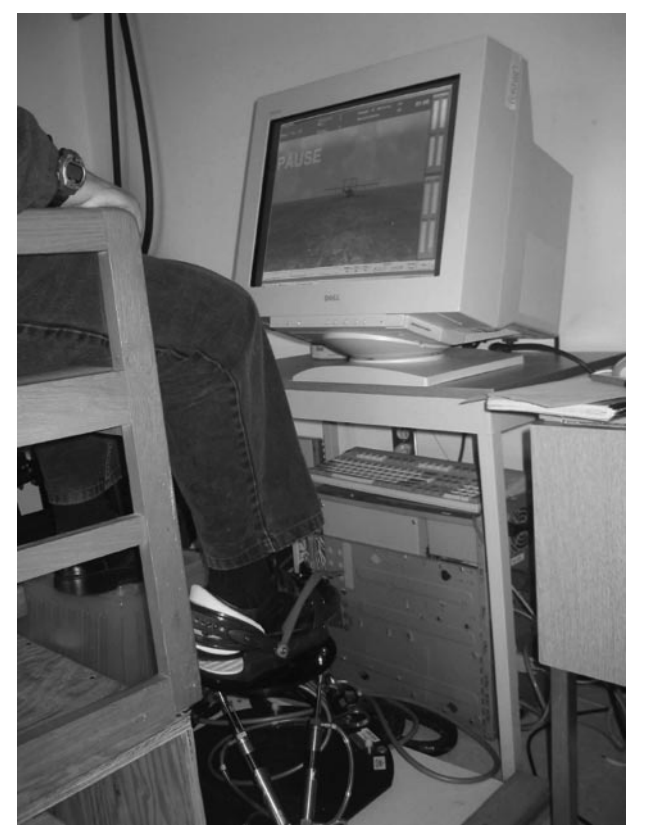
Figure 1. Robotic VR device.

Subjects in the robot VR group executed the exercises by using the foot movements to navigate a plane or a boat through a virtual environment that contained a series of targets. The position and timing of the targets were manipulated to insure training included discrete and combined ankle movements. Subjects who trained with the robot device alone received the same exercises as the robot VR group but without the virtual environment. The computer screen was occluded to block visual and auditory feedback. High-level haptic feedback synchronized with the simulation was turned off; however, low-level force feedback was provided by the robot.<sup>22</sup> Subjects in the robot alone group were instructed by a therapist on what direction to move their foot and were paced by a metronome cueing them to